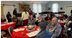
Members, family, and friends celebrating.